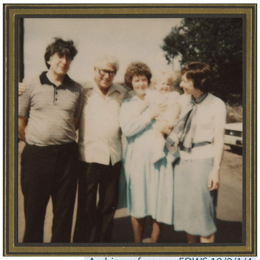
Archive reference: EDWS 18/9/1/4

The Edwards papers will be valuable for researchers in the history of science and medicine, but also in the history of ethics,